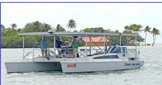
The arrival of Sun21 in the port of Martinique on 2 February 2007 marked its entry into the book of world records

The journey posed many challenges and in December, 2006, the crew faced it's first big storm with winds up to force 7 on the Beaufort scale. The ship took refuge in Casablanca. The important lesson learned was that the ship could weather a strong blow and bring its crew to safety.